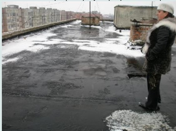
Photo -9: Local communities actively apply community-based approach in cooperation with local authorities in Rivne

But the roof was not the only problem. The house hot and cold water supply system required immediate replacement. The attempts to change the pipes in particles did not succeed. In order to block the water in the house the water in the whole microrayon should be blocked. The community decided at the General Meeting of the ACMH to prepare project proposal for replacement of hot and cold water supply pipeline.