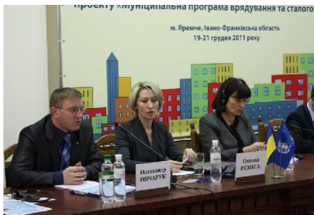
Photo- 4: The seventh meeting of the National Forum of partner municipalities gathered more than 70 participants