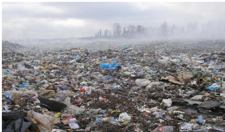
Photo-6: The landfill in Tulchyn is 100% full and inter-municipal cooperation offers a mechanism to solve this problem

The wastes at the landfill are not neutralized/deactivated and pose highest level of danger to human and environment. The municipality needs a new solid waste landfill which would respond to standards of sanitary and hygienic conditions and would not damage environment. The partners of Inter-municipal cooperation are: Tulchyn City Council (Co-financing of the project and leader in implementing the project/coordination); Suvorivska village Council (providing land for SW landfill), Kynashivska, and other.