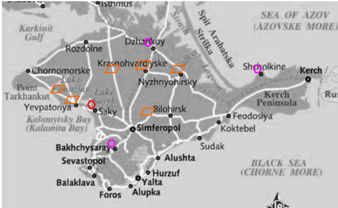
Map-2: Location of the Programme area in AR Crimea by year of partnership