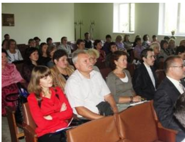
Photo- 5: The conference revealed that Ukraine is the only country to include sustainable development issues into education programs of all levels, starting with elementary school, secondary school and all the way to high education

The original academic course “Sustainable Development of Society” was developed by the Academy of Municipal Management under UNDP/MGSDP support in 2007. The goal of this course is to train current and future generations of civil servants, policy makers, CSOs, private sector, representatives of academia and scientific community on concepts and processes of participatory and sustainable local development. During 2007-2009, the Programme established partnership with four Ukrainian universities for introducing the course into their official curricula.