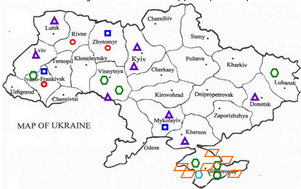
Map 1: MGSDP Programme Area

Map-1 shows location of the Programme area in Ukraine by year of partnership.