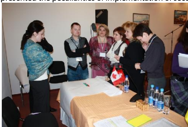
Photo-11: The participants of the MSU received an advanced training on social mobilisation as a basis of local participatory development