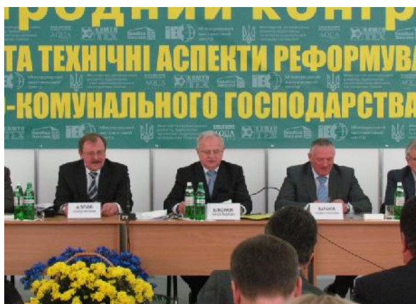
Photo-2: The participants discussed modern technologies of tap water purification, utilization of precipitation, energy saving, housing reformation, water resources and ecology protection, investments into plumbing modernization

On June 6 to 10 the UNDP/MGSDP participated in the Congress on housing and municipal economy, held by the Ministry of Regional Development, Construction and Housing and Municipal Economy in Yalta. The event included the participants from the Ministry of Ecology and Natural Resources, Ministry of Economic Development and Trade, Ministry of Health protection, Emergency Ministry, Ministry of Energy and Mining, National Academy of Sciences, State Agency on Water Resources, State Agency on Energy Efficiency and Saving. Within the framework of the event the exhibition on water equipment was held. The main speeches and recommendations of the conference were