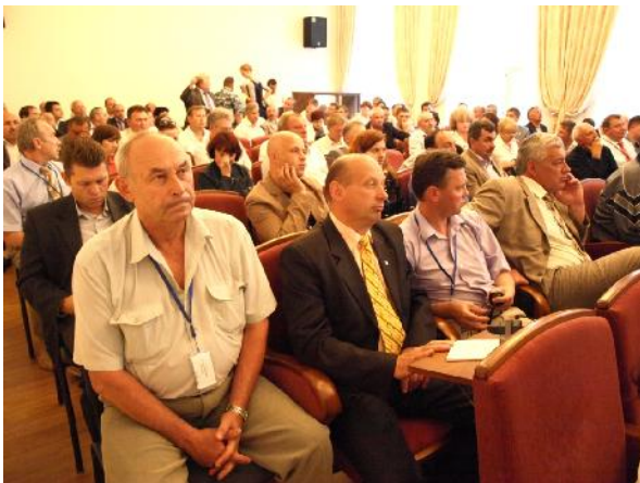
Photo-3: Experience of UNDP/MGSDP was presented at the VII Municipal Hearings

On June 29 - July 2 the UNDP/MGSDP supported the VII Municipal Hearing, initiated by the Association of Ukrainian Cities in Illichivsk (Odesa Region). The event aimed at discussion of local self-government and decentralization at the expert level. Representatives of the local and state authorities and international organizations participated in the event.